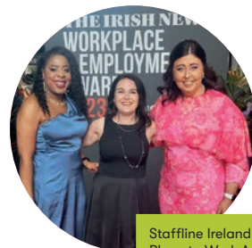
Staffline Ireland, Irish News Best Place to Work Award winners