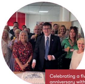
Celebrating a five year contract anniversary with the PeoplePlus team in Scotland