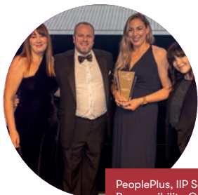
PeoplePlus, IIP Social Responsibility Organisation of the Year Award winners